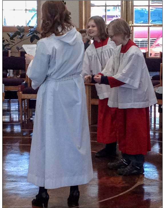
Our acolytes use their imaginations to help stir the "stone soup" during the sermon story on February 23