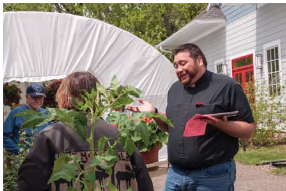
Having a wonderful time at the Plant Sale

These questions are very real. We should not ignore them, but rather we should explore them and see how we might be able to work with them as the Holy Spirit calls us.