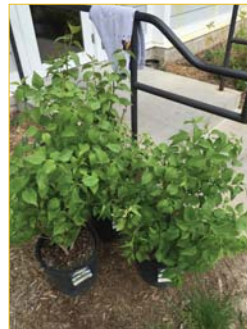
Everybody enjoys St. Edward's Plant Sale!